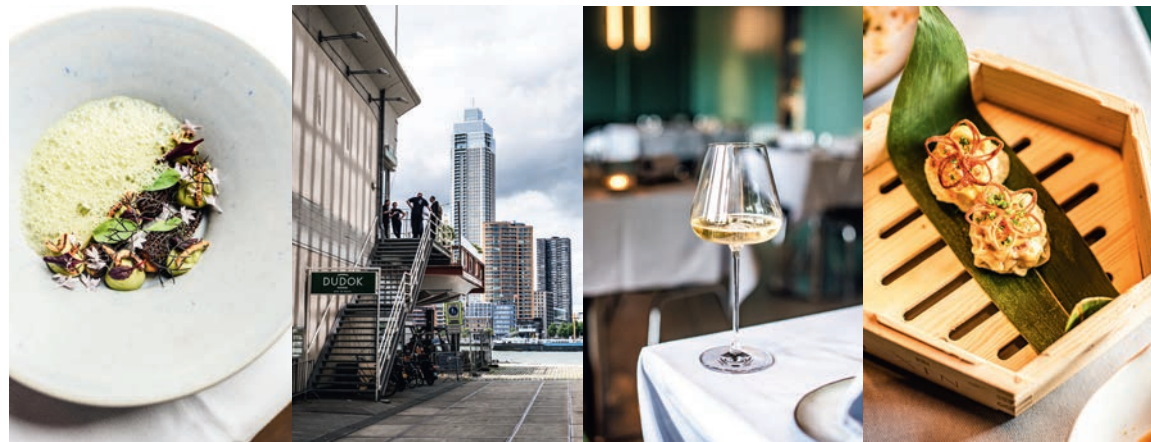
Clockwise from far left: Prawn-stuffed morel mushrooms, De Matroos en Het Meisje; redeveloped docklands of Kop van Zuid; champagne at Xin; dim sum; Fenix. Opposite page, clockwise from top left: Alexander Wong; North Sea crab, rice wine, caviar; steamed scallop; the café-lined Oude Haven