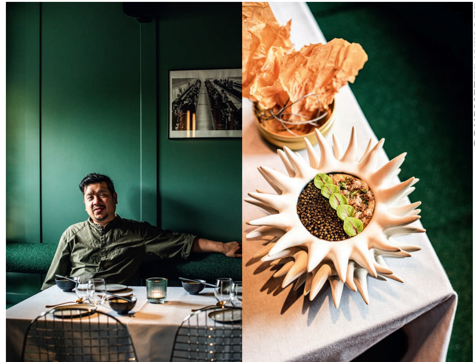
At Tres restaurant, traditional comfort bites are turned into modern delicacies: a savoury version of a tompouce pastry swaps crème pâtissière and pink icing for lobster tartare and crispy fish skin

Michael likes using unripe fruit for acidity, but these haven't always been easy to source. 'When I first rang farmers to enquire about pale, unripe strawberries, several hung up, thinking it was a prank call,' Emy laughs. When an ingredient is unavailable, Michael experiments, making his own miso with local yellow peas instead of soy beans, substituting barley for rice. A self-taught