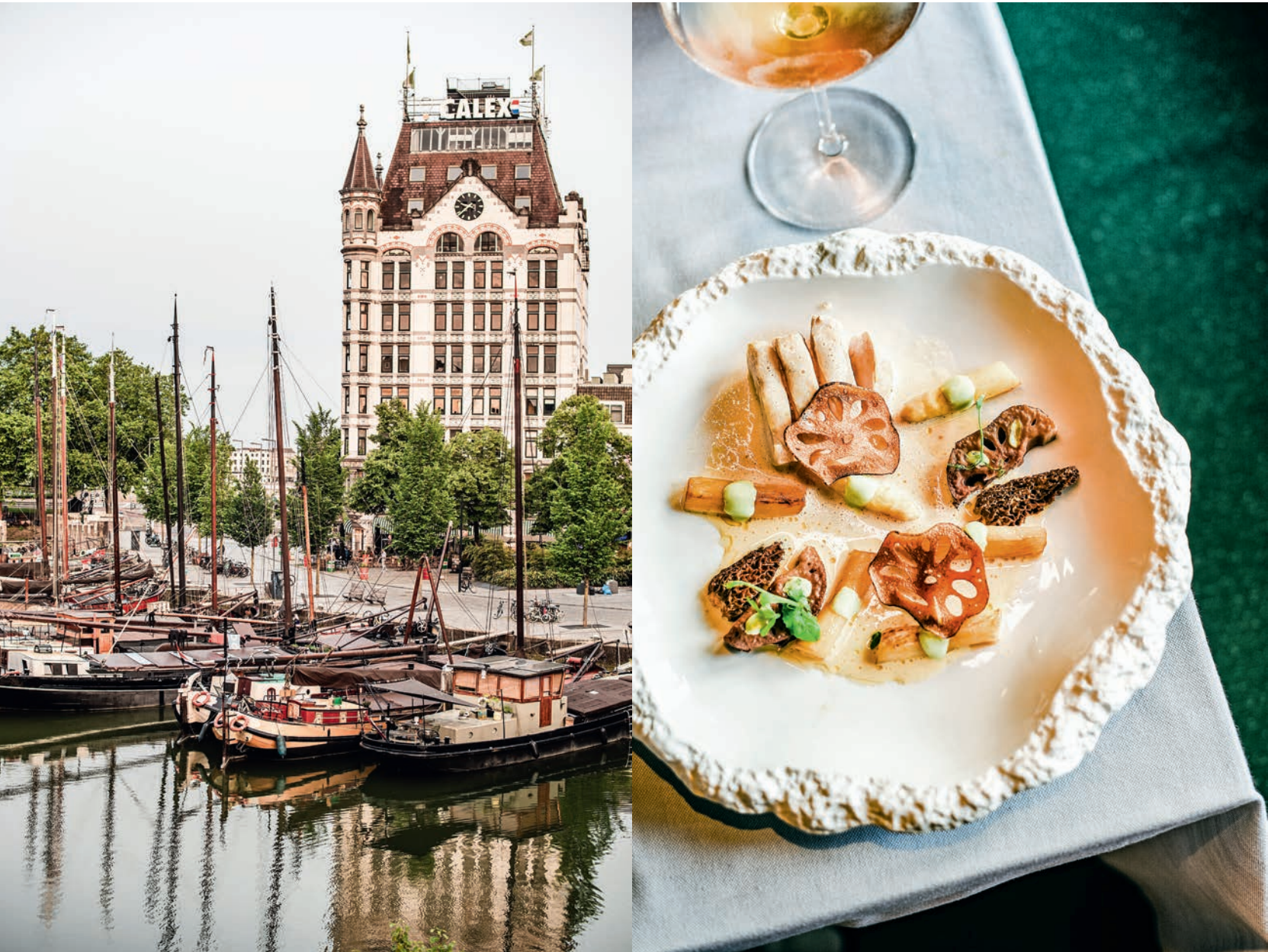
This page, from left: Oude Haven (Old Harbour); three-poached chicken, asparagus, lotus root at Xin. Opposite page: A tempting bakery window in Deliplein plaza

WORDS AND PHOTOGRAPHY BY KAROLINA WIERCIGROCH